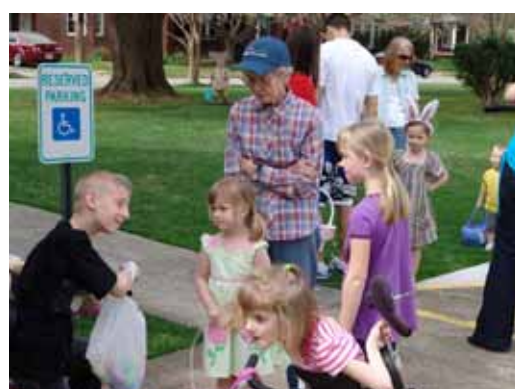
Egg hunt 2010