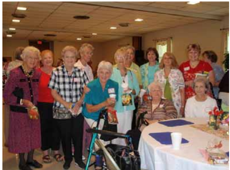
Ladies that attended meeting.